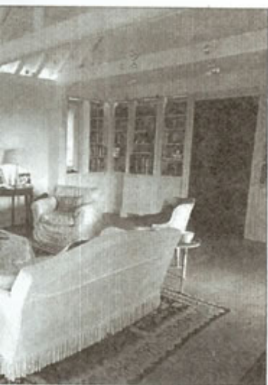
ck (left) Impressed Suzie Dolbey (below)